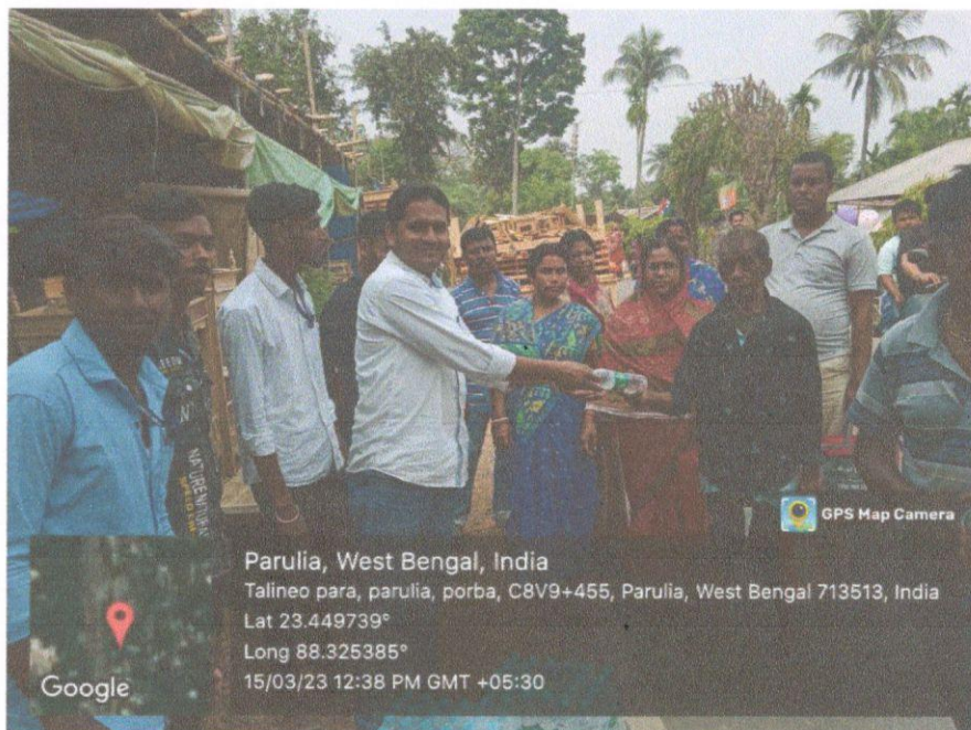
Fig. 1 and 2. Providing Clean Drinking Water to the Attendees of Shitala Puja