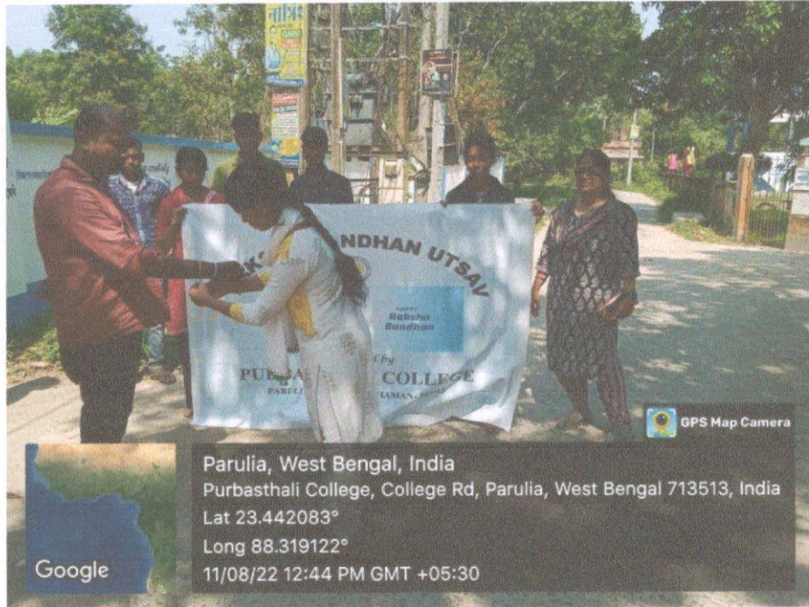
Fig. 1. Rakhi Bandhan Utsav on 11/08/2022

Principal Purbasthali College Parulia, Purba Bardhaman.