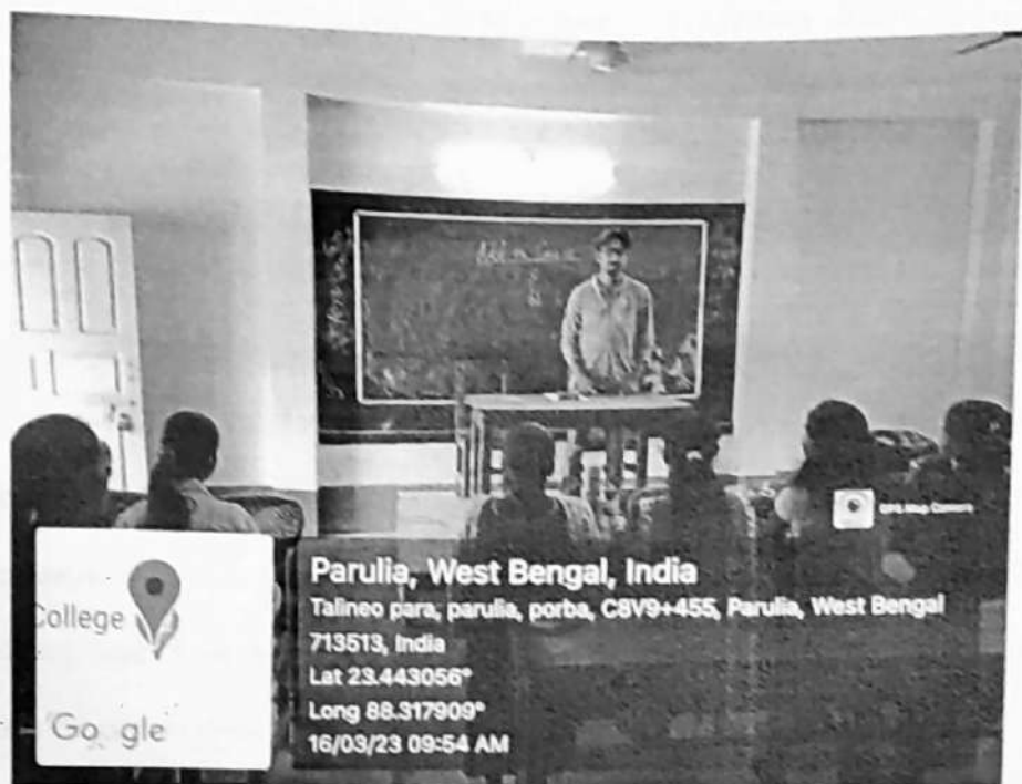
Fig: First day class of the course

The Add-on course offered a comprehensive journey into the intricacies of the English language, aiming to equip participants with a multifaceted skill set essential for effective communication and confident public speaking. Beginning with an exploration of the fundamentals of English grammar, participants delved into crucial elements such as vocabulary, sentence structure, phrasal verbs, idioms, and word formation. This foundational knowledge served as the bedrock upon which subsequent modules build. Moving forward, participants embarked on a journey to refine their pronunciation skills, delving into the nuances of phonetics and engaging in targeted listening exercises designed to enhance their ability to articulate sounds accurately and comprehend spoken English with clarity. As participants progress, they transitioned to the development of reading and writing