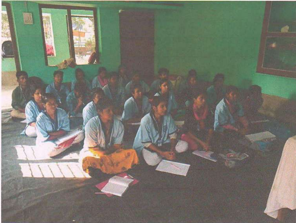
Fig. "Fit India Campaign 2022" on 21.06.2022