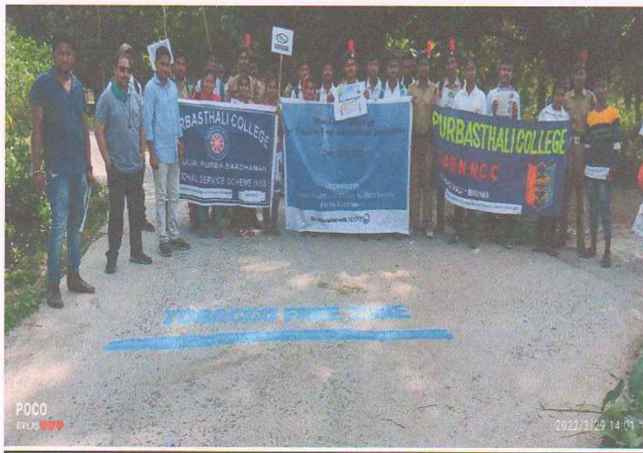
Fig. "Tobacco Control Programme " on 29.03.2022