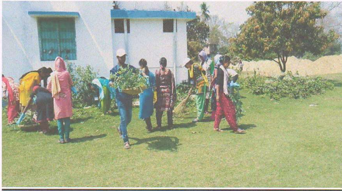
Fig. " Clean India Programme" on 20.02.2022