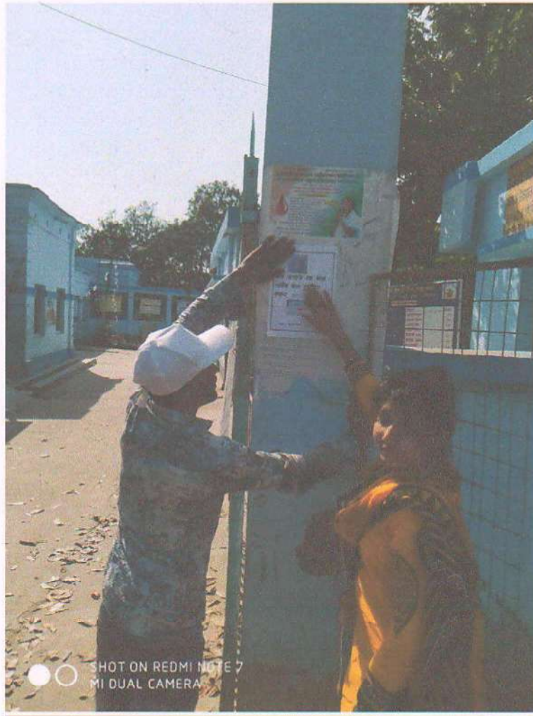
Fig. "Rally on Water Preservation " on 29.03.2022