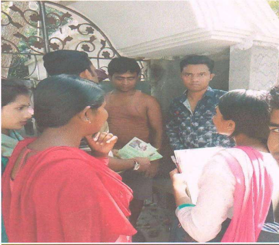
Fig. "Programme on 'Stop Stigma of HIV/AIDS 2021' on 02.12.2021